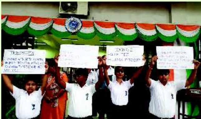
Creating Awareness about Corona Virus