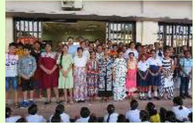
European Language Day Celebration