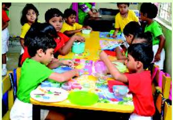
Clay Modeling Competition For KG Students