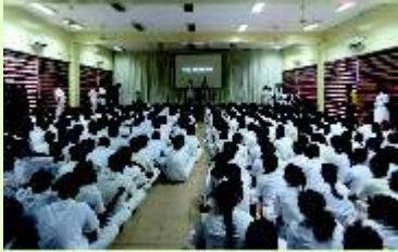
SVG session in Multi Purpose Hall