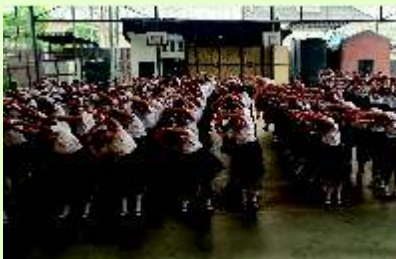
Exercise with Music