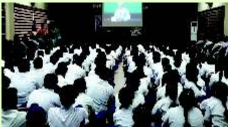
Pariksha Pe Charcha-Live Telecast