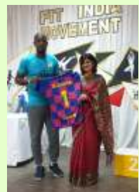
Special Gift for the Principal by the Coaches