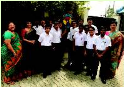
Rakshabhandhan- Save Nature