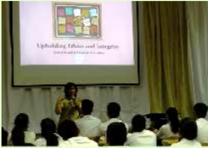
Session by Principal -Ethics and Integrity