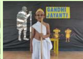
Gandhi Jayanti Celebration-Juniors