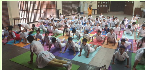
Fitness for All