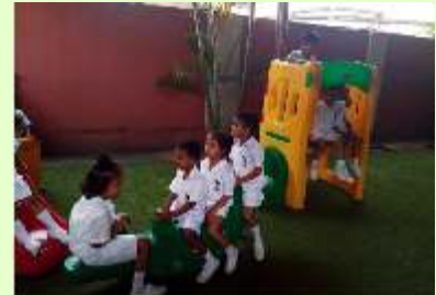
Play Time is the Best Time-Juniors