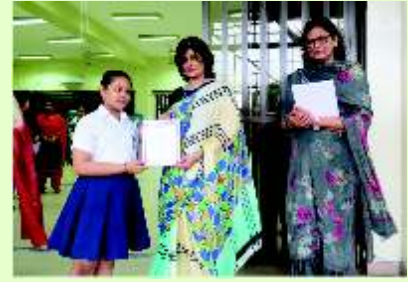
winner of the English Poetry Competition