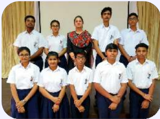
CAREER COUNSELLING COMMITTEE