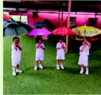
Love the Rainy Season