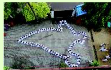
We love our India-India Map by Students