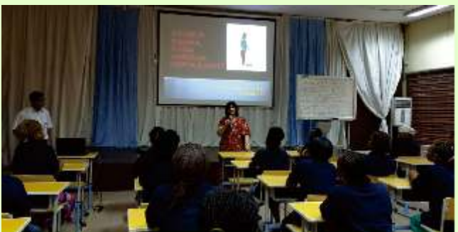
Creating Awareness for the Non-Teaching Staff regarding Corona Virus