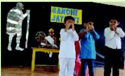
Gandhi Jayanti-See No Evil, Hear No Evil, Speak No Evil