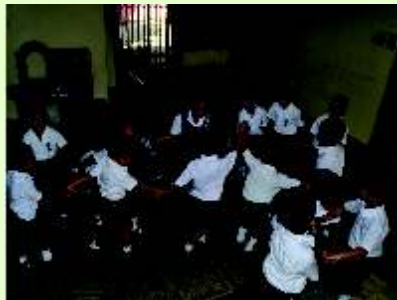
Ring-a-Ring O' Roses