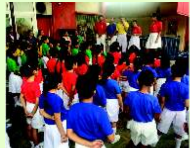
DEAR Committee -Positive Effects of Reading Books