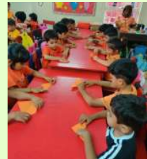
Orange Day- Juniors