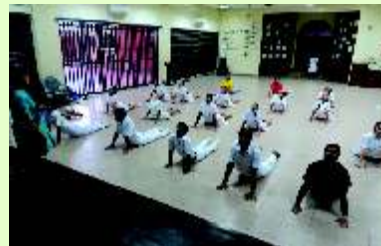
Yoga for Good Health