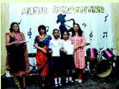
Music Competition- Grade III to V