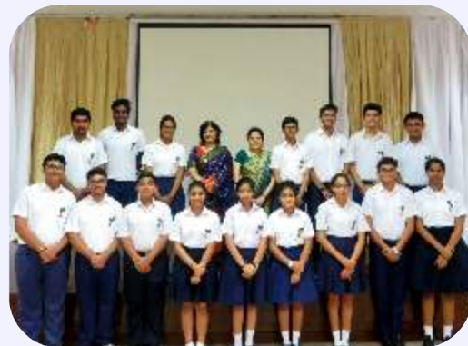
PERSONALITY DEVELOPMENT COMMITTEE