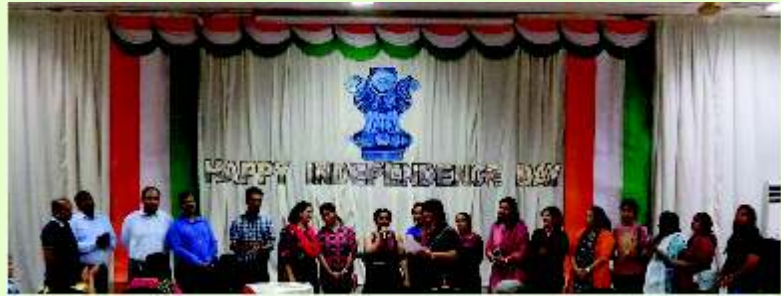
PTA Team -A Warm Welcome