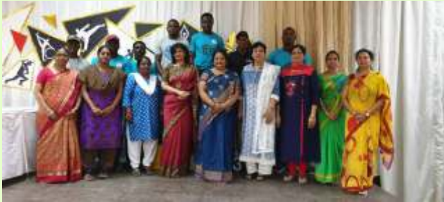
Fit India Movement ILS Team