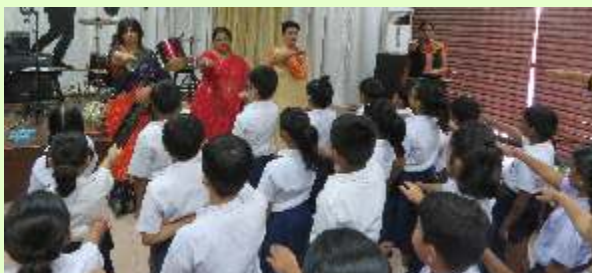
Fit India Movement Pledge