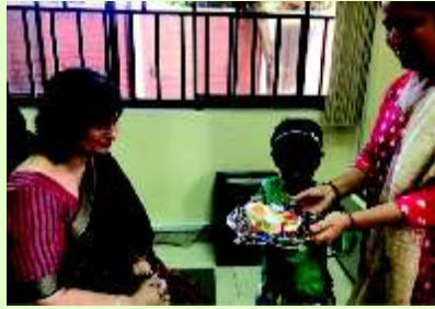
Kindergarten celebrates Rakshbandhan with Principal