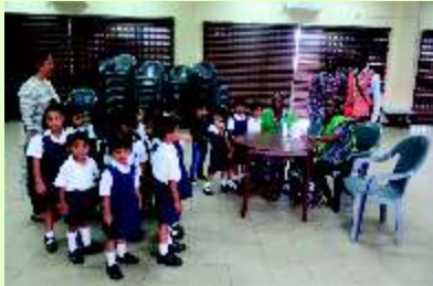
Polio Drops for KG Students