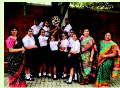
Rakshabandhan -Save the Tree