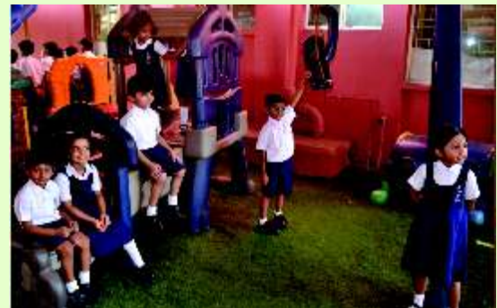
Plattime for Juniors