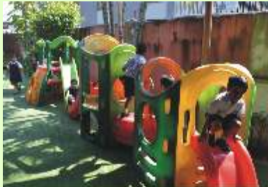
Play is their Brain's Favourite way of Learning