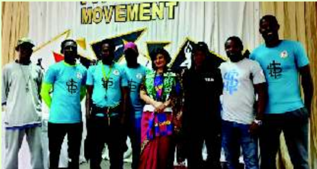
Principal with the ILS Coaches