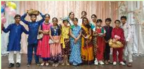
Imaandari Ka Mahtav-Skit on Hindi Diwas