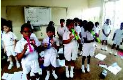
Music is Food for the Soul