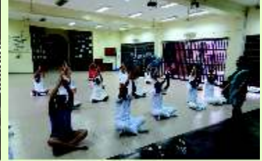
Yoga for Mind and Body