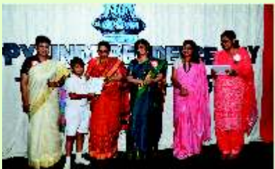
Hindi Poem Recitation Competition