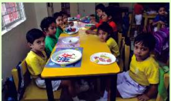
Clay Modeling Competition-Creativity with Pkat-Doh