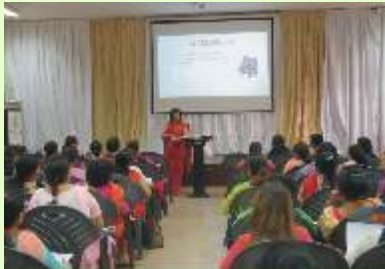
Professional Devlopment of Teachers