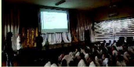
Career Counselling by GR 12 outgoing batch