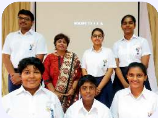
STUDENT COUNSELLING COMMITTEE