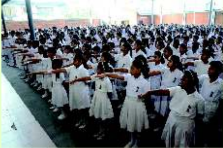
Ekta Diwas Oath Taking Ceremony