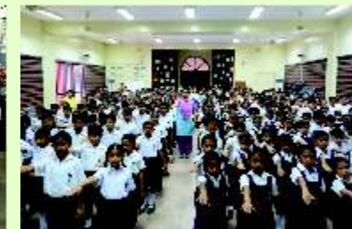
Fit India Movement Pledge by Students