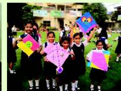
Kite Flying Day on Basant Panchami