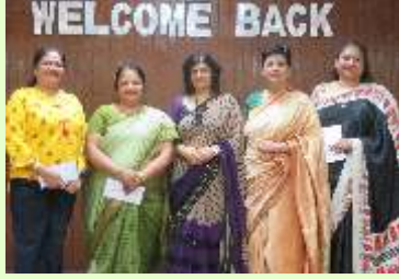
Long Term Service Awards