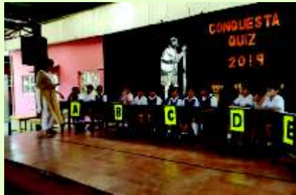
Conquesta Quiz- Juniors