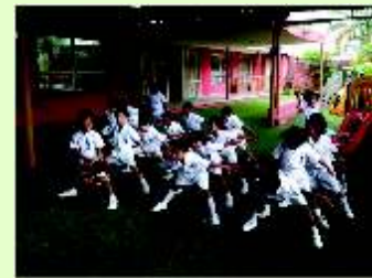
Health is Wealth