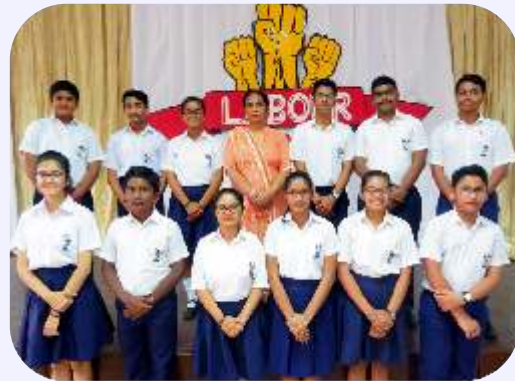
SCHOOL SAFETY COMMITTEE