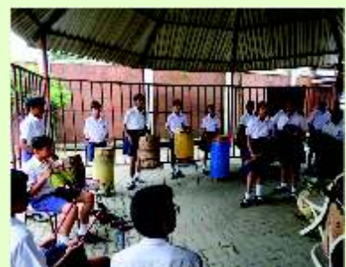
ILS Promising Musicians