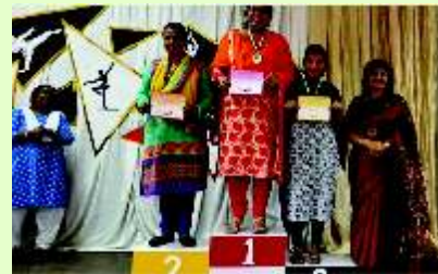
Our Athletic Teachers