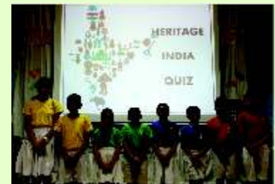
Heritage India Quiz