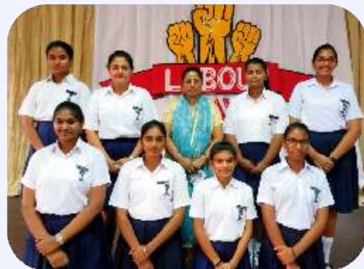
HEALTH & WELLNESS COMMITTEE