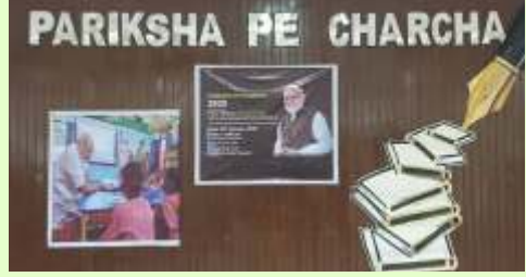
Pariksha Pe Charcha (2)